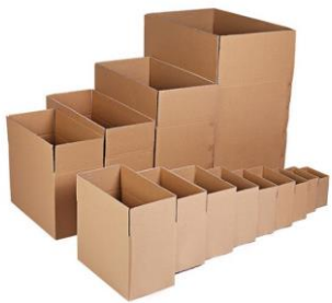
纸箱 Paper Box