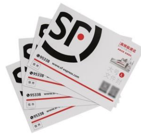
快递袋 Express Bag