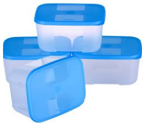
塑料盒 Plastic Box