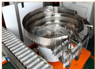
振动盘上料系统 Vibratory Feeding System