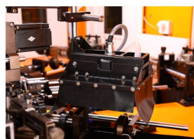
LED UV固化系统 LED UV Curing System

可根据客户要求定做自动化印刷生产线 We are able to design and produce screen-printing production line according to your own requirements!