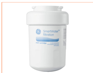
承印物 Printing Object