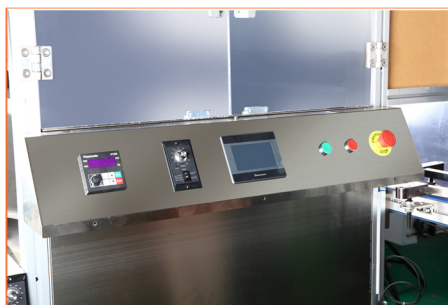
提升式自动上料系统 Lifting Automatic Feeding System