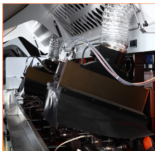
UV固化系统 UV Curing System