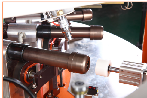
管位 (18工位) Tube Position (18 stations)