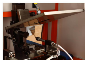
LED UV固化系统 LED UV Curing System

可根据客户要求定做自动化印刷生产线 We are able to design and produce screen-printing production line according to your own requirements!