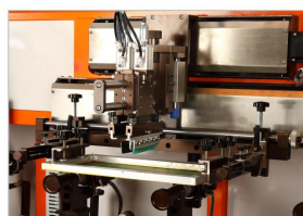
丝印系统 Screen Printing System